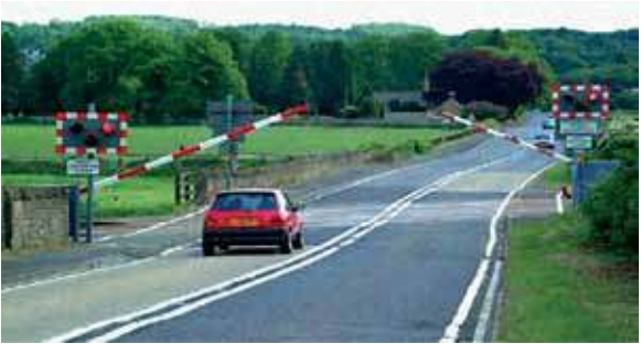
Automatic half-barrier level crossing